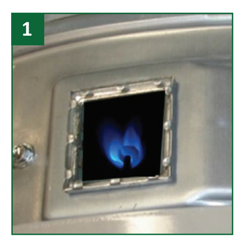
No Hot Water

Check for pilot. If pilot is not lit, try relighting the pilot using instructions on water heater. The pilot can be hard to see, so you may need to dim the room lights.