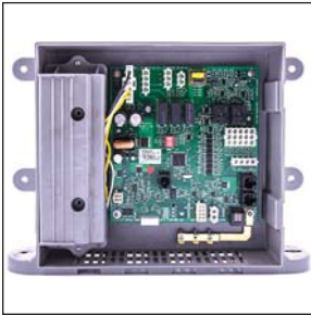
Central Control Board (CCB)

The Sequence of Operation is controlled by a computer called the CCB. This board looks at two temperature probes to determine the temperature of the water in the tank and compares that to two settings on the display: the Set Point and the Differential.