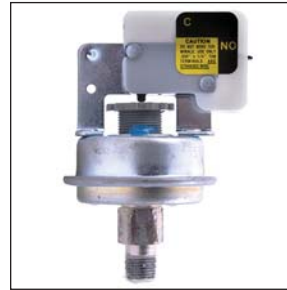
Low Gas Pressure Switch

Pressure Switches have a plastic diaphragm that opens or closes an electrical switch, depending on the pressure of the air or gas and depending on whether the switch is normally open or normally closed and also whether the switch responds to positive pressure or negative pressure (vacuum). Pressure switches are activated by either a positive pressure or a negative pressure (vacuum) depending on the type of switch. The activation pressures are typically small (measured in inches water column). Pressure switches are designed to operate at a very specific pressure and must be replaced with the exact replacement part recommended by the manufacturer. Never substitute a “similar” pressure switch. Always use