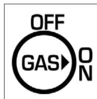
Gas Valve icon indicating Gas Valve should be on